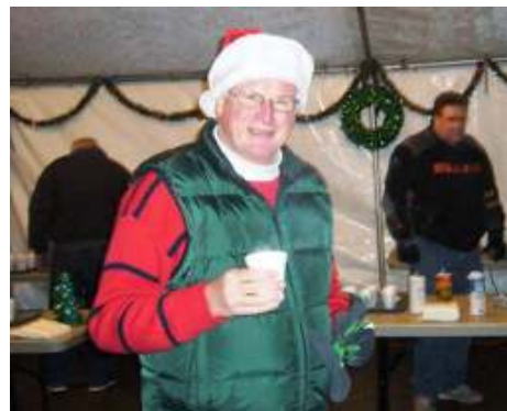
Glenn Grothman at the Lakeshore Holiday Parade in Manitowoc November 26.