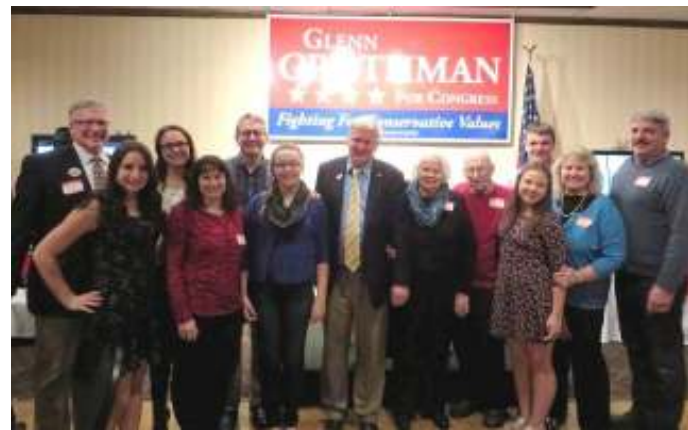
Glenn Grothman, his parents, brother and family members on election night celebrating his election to Congress

Thank you to those who serve and have served this great country. May God bless you always — Happy Veterans Day