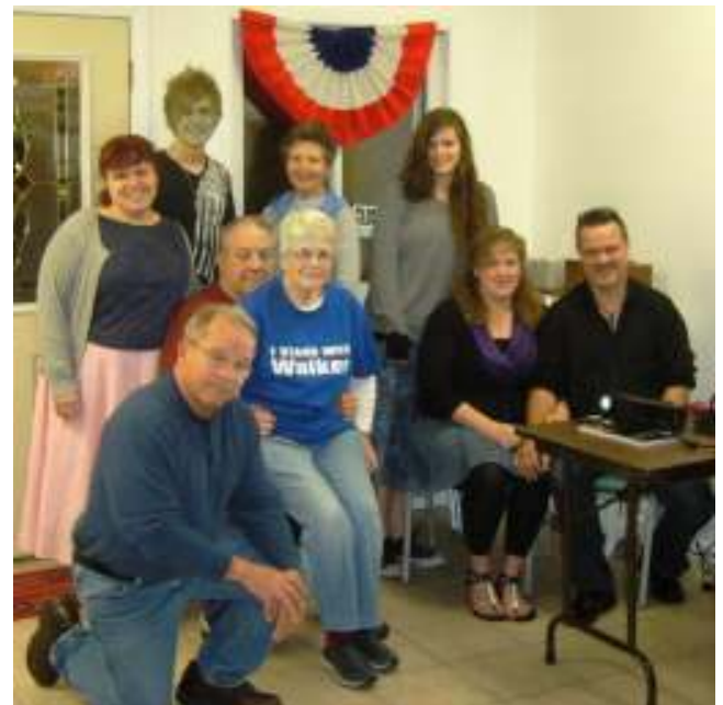
Watching the Walker/Burke debate at Manitowoc GOP headquarters October 17

To join, go to: https://anedot.com/campaigns/ca0971a0503/donations/new or mail a check to: Glenn Grothman for Congress, PO Box 1215, Fond du Lac, WI 54936.