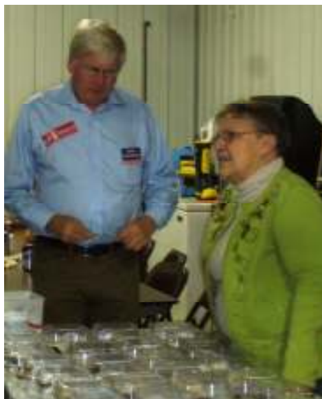
Glenn Grothman talking to a voter at the Silver Creek Fish Boil/steak Fry Oct 3.