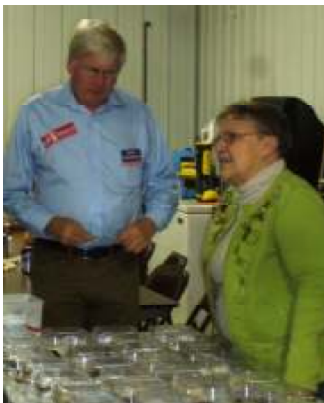
Glenn Grothman talking to a voter at the Silver Creek Fish Boil/steak Fry Oct 3.