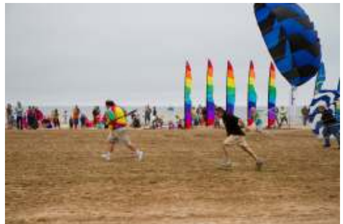
"Running of the Bols" at Kites Over Lake Michigan