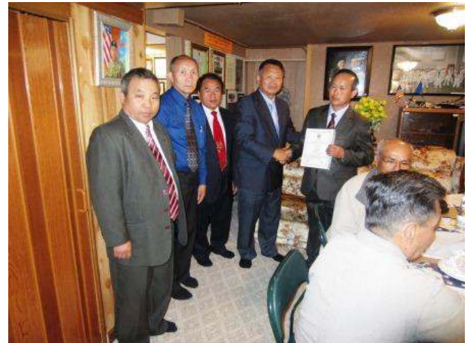
Hmong GOP Labor Day celebration