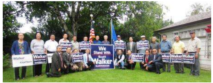
Hmong GOP shows its support for Governor Walker on Labor Day.

The most powerful impact on persuadable voters is having someone they know and trust vouch for a candidate. The Community Captains Program is a common-sense approach; it's campaigning as it was meant to be. It's grassroots organization and word of mouth to get voters to the polls. What can you do to help keep moving Wisconsin forward? How about: