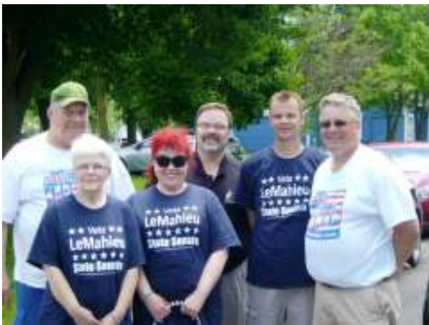
Reedsville Fireman's Parade June 29, 2014

While cookouts, vacation, fireworks, parades, and picnics are fun, let us not forget what this day means, how it came to be and why it continues to be important today. The men who built this country risked their lives plus spent considerable energy and time pursuing an ideal the world had never seen. As we lose freedom after freedom and step closer and closer to a nation governed by a President who acts like a king creating new ways to control us all, Americans are losing hope, care and belief that this is, in fact, their country. The Republican Party has always honored the idea of freedom; in fact, party roots were originally driven by the anti-slavery movement. We are the party of freedom. While the Founding Fathers of this great nation would be disappointed with the neglect we show to that for which they risked so much, I believe they would be pleased with the Republican Party and its ideals and principles. Thankfully, we do not need to risk as much as our Founding Fathers but let's ensure we do not take for granted that which they risked for us.