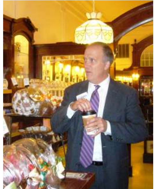
Brad Schimel visits Beerntsen's October 31 during a campaign stop.